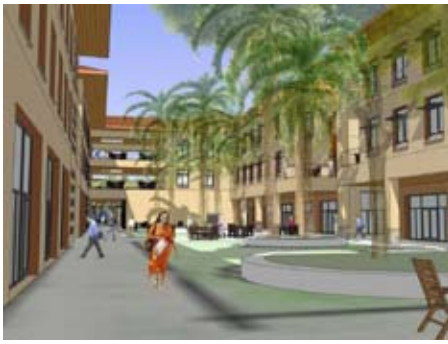
OPEN SPACES AND WALKWAYS IN THE NEW CAMPUS WILL ENABLE INTERACTION