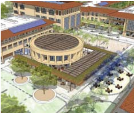
THE DINING PAVILION WILL BE A CENTER OF ACTIVITY BOTH INSIDE AND OUTDOORS