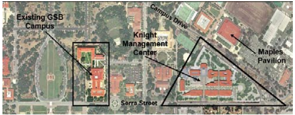
MAP OF THE SERRA STREET CORRIDOR, WITH THE NEW GSB LOCATION ON THE RIGHT