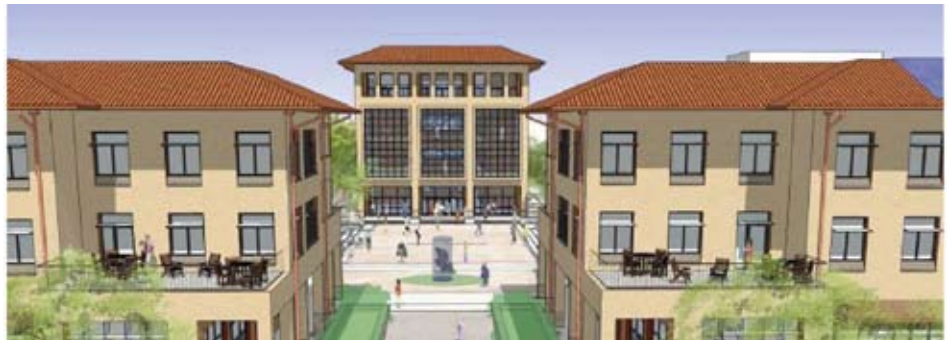
MAIN ENTRANCE TO THE KNIGHT MANAGEMENT CENTER BETWEEN TWO OF THE SERRA STREET CLASSROOM BUILDINGS

“This campaign is a once-in-a-lifetime opportunity to have a lasting impact. Just as its alumni must do in the business world, the GSB must lead the way and set new standards. The new campus will support new methods of teaching management and leadership while also inviting collaboration from colleagues across Stanford.”